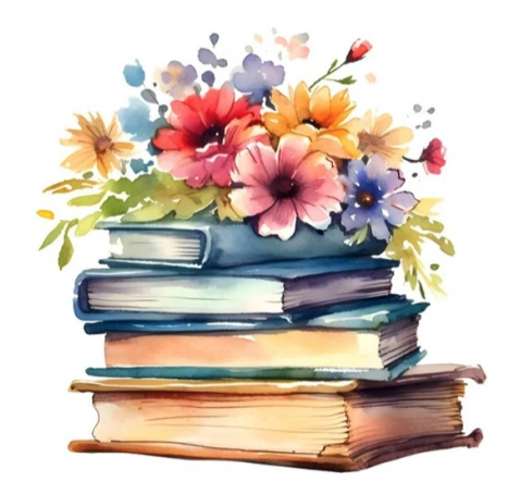
'Celebrating Books' Saturday 14<sup>th</sup> – Monday 16<sup>th</sup> June 2025 In conjunction with The Rowell Fair